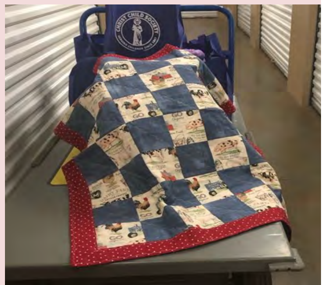
Here is an example of the beautiful quilts made by the wonderful ladies of Dove Mountain's Sip & Sew Quilt Club.