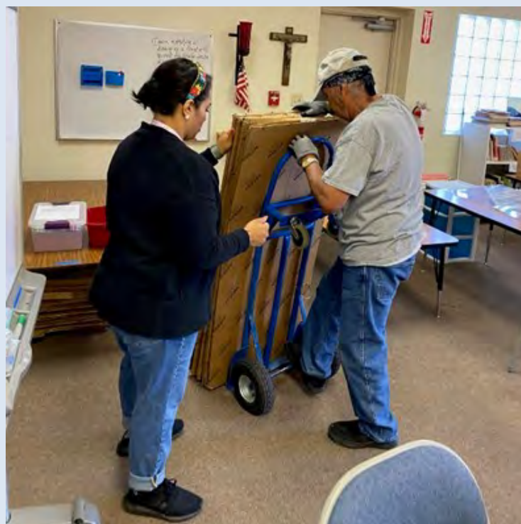
OMOS Staff removes Covid plexiglass and makes room for the prayer corner.