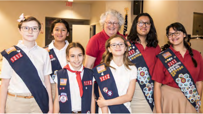
Jr. Christ Child Members, who are also American Heritage Girls, conducted a opening flag ceremony as well as helped served at the event.