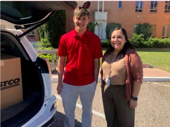
St. Augustine's student and staff member pack up all of the donations from their Pack-the-Playpen Lenten event.